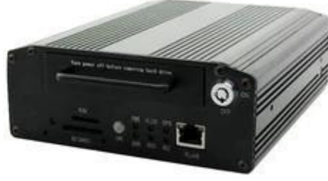
HD Mobile DVR with 3G GPS