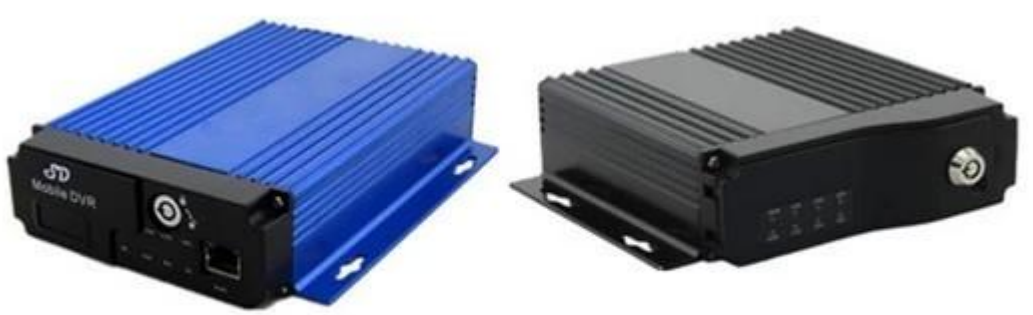
SD Mobile DVR with 3G GPS