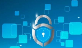
Advanced encryption technology Encrypted transmission to protect data