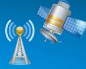
GPS+4G-WIFI High-precision positioning