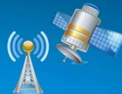
GPS+4G+WIFI High-precision positioning