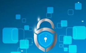
Advanced encryption technology Encrypted transmission to protect data