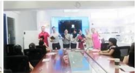
Inner Training after study from Alibaba in July