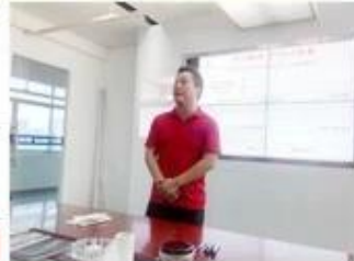
lecturer for Execution