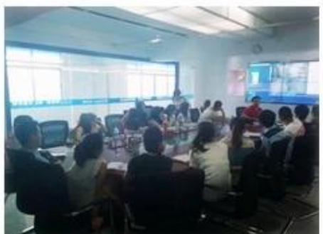
Technical Training For Fast Response to Customer Richmor 锐驰曼