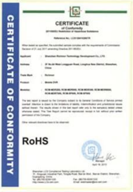
Richmor Outros produtos: DVR Nível industrial móvel DVR móvel's embalagem: