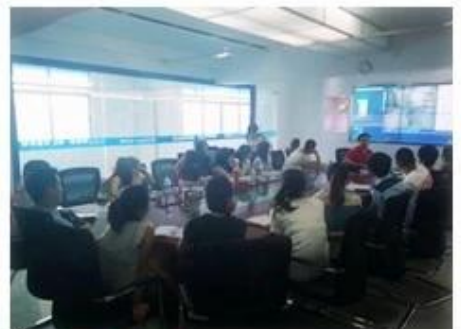
Technical Training For Fast Response to Customer Richmor 锐驰曼