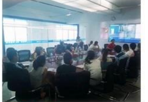
Technical Training For Fast Response to Customer Richmor 锐驰曼