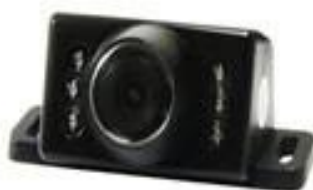
Small Car Back