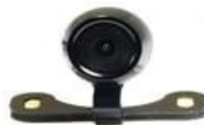
Small Car Back