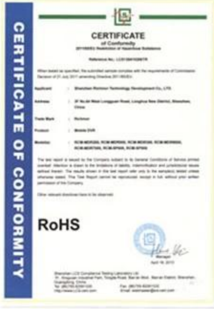
Richmor Outros produtos: DVR Nível industrial móvel DVR móvel'S embalagem: