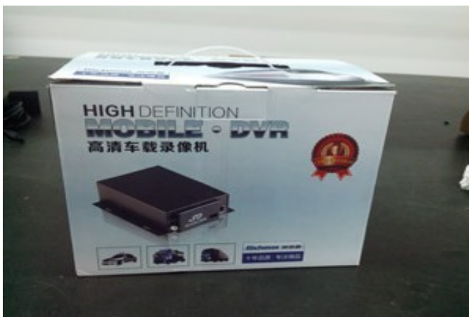
Richmor Brand Package

3. If the HDD is connect well, if the HDD/SD light is on.