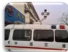
Traffic Inspection Car