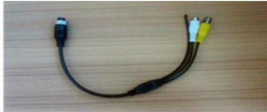
AV Output Cable