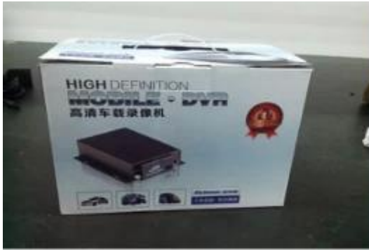
Richmor Brand Package