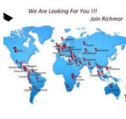
6. Join Richmor