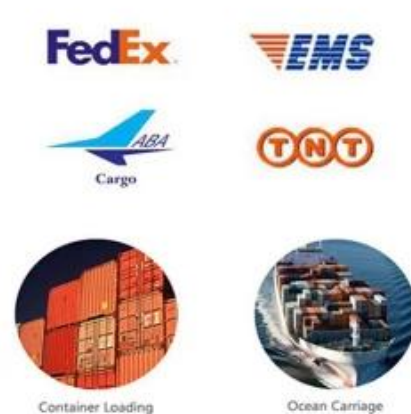
5. Support all ways of delivery