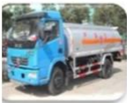
Dangerous chemical car

Omnibearing Viewing and Total Vision Protection