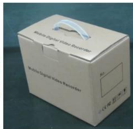
3. Neutural box