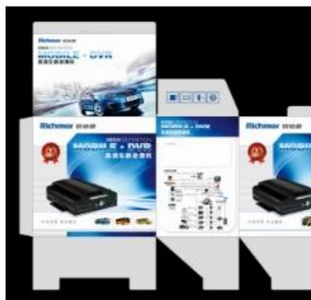
2. Box with Richmor