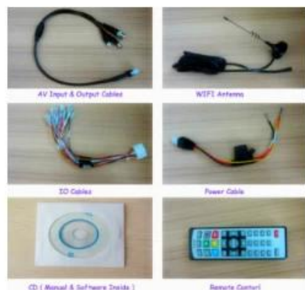
4. Standard accessories