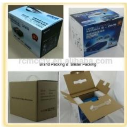
1. Special brand packing

Delivery Details : We can delivery goods by air, by sea, by truck, etc. 5-15days after deposit and order details confirmed.