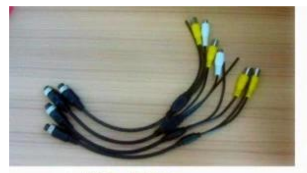
AV Input Cables