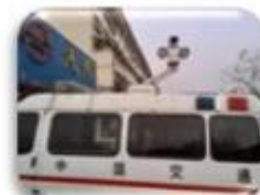
Traffic Inspection Car