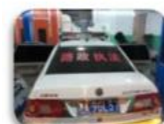
Road Police Car