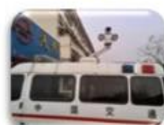
Traffic Inspection Car