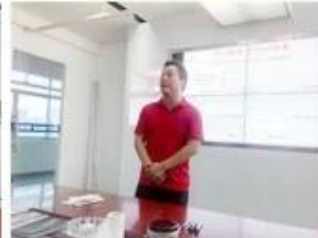
lecturer for Execution