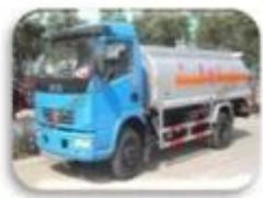
Dangerous chemical car