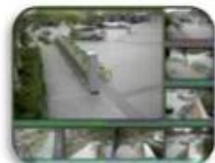
Fixed place monitor