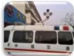
Traffic Inspection Car