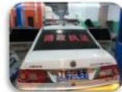
Road Police Car