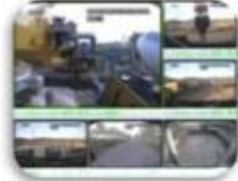
Civil Work Vehicle