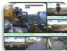
Civil Work Vehicle