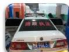
Road Police Car