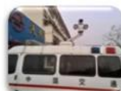
Traffic Inspection Car