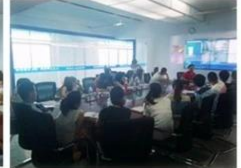
Technical Training For Fast Response to Customer Richmor 锐驰