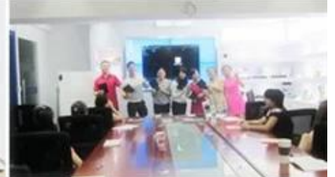
Inner Training after study from Alibaba in July