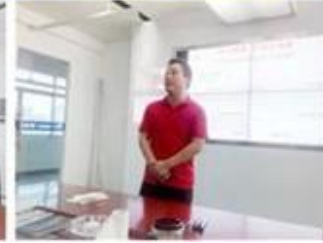
lecturer for Execution