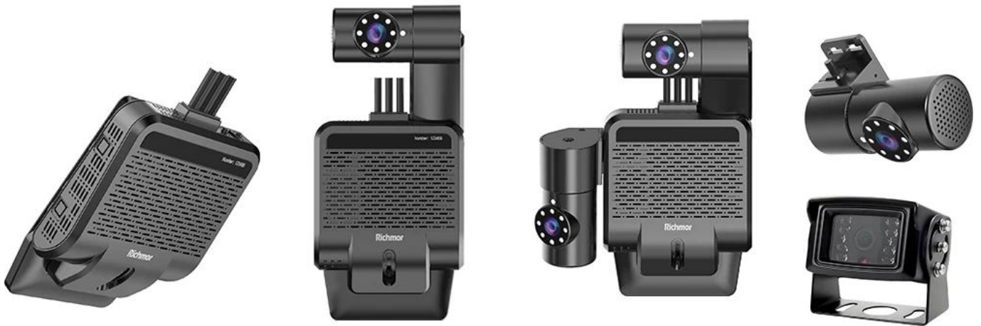
1CH Dashcam Built-in Front camera

2CH Dashcam (Built-in front and cabin camera) + 1CH/2CH/3CH External Camera become 3CH / 4CH / 5CH Dashcam.