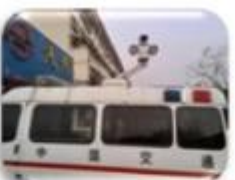
Traffic Inspection Car