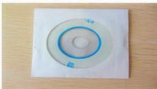
CD ( Manual & Software inside)

Neutral paper box or Color paper box with Logo Richmor printed,also welcome customized package.