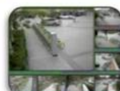
Fixed place monitor