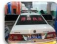
Road Police Car