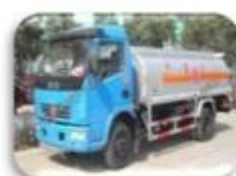
Dangerous chemical car