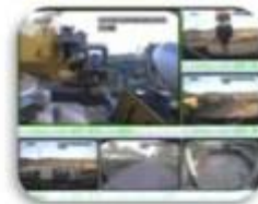
Civil Work Vehicle