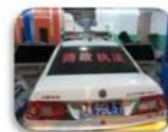
Road Police Car