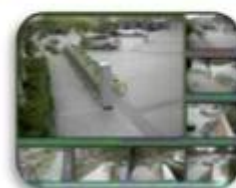
Fixed place monitor