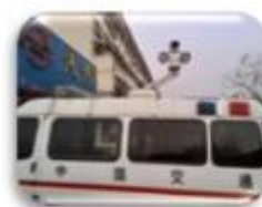
Traffic Inspection Car