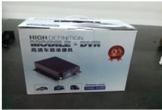
Richmor Brand Package