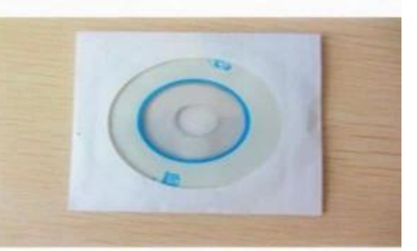
CD ( Manual & Software inside )