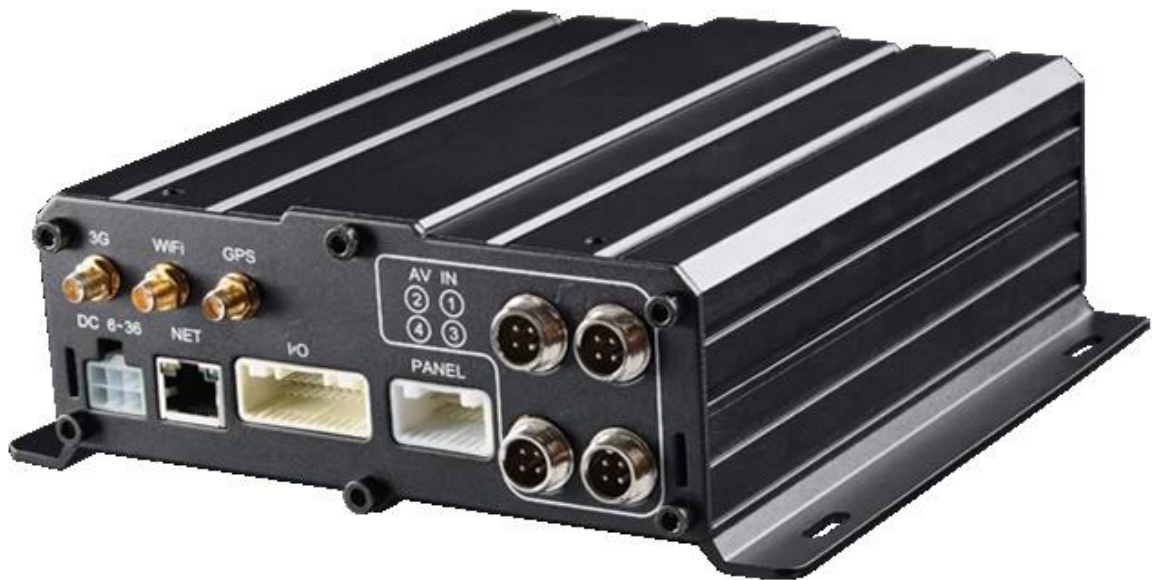
HD Vehicle DVR on sales