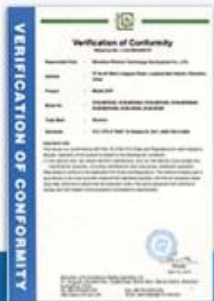
VERIFICATION OF CONFORMITY