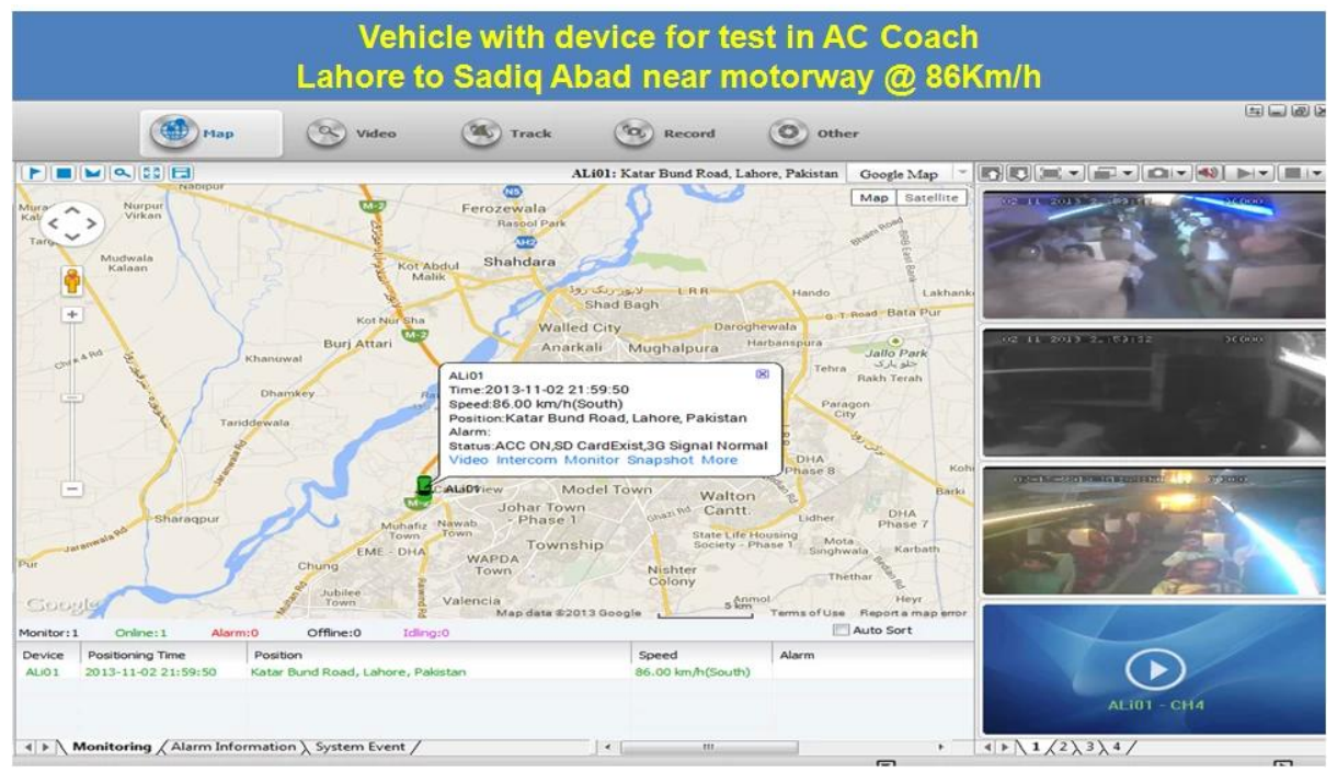
For Windows PC real-time Surveillance

For IOS & Android OS Mobile Phone Surveillance