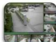
Fixed place monitor