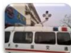
Traffic Inspection Car