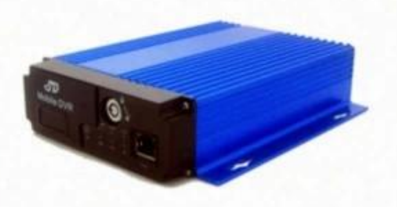
SD Mobile DVR