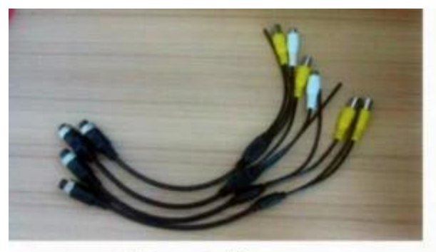
AV Input Cables