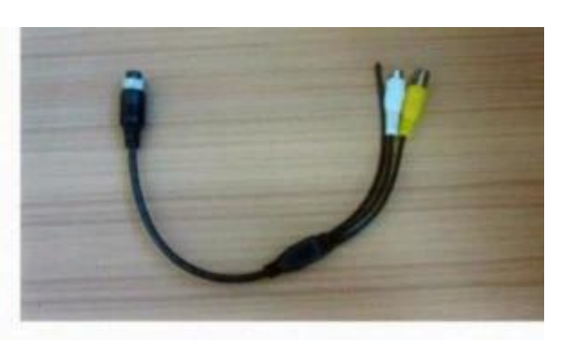
AV Output Cable