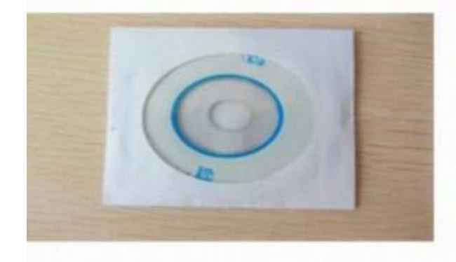
CD (Manual & Software Inside)