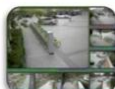
Fixed place monitor