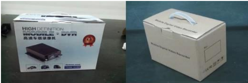
Richmor Brand Package

Neutral paper box or Color paper box with Logo Richmor printed,also welcome customized package.