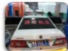
Road Police Car