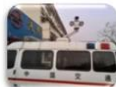
Traffic Inspection Car