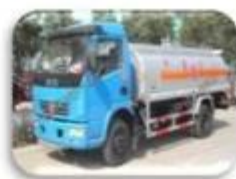
Dangerous chemical car