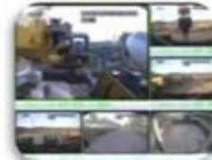
Civil Work Vehicle