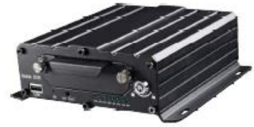
7105 Series- AHD 5CH