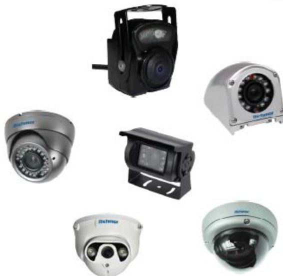
Car Camera Series