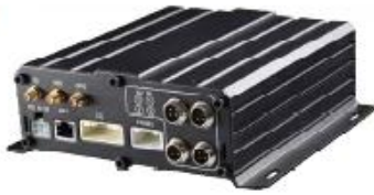
7104/7204 720P/1080P Series-AHD 4CH (Top Sale)