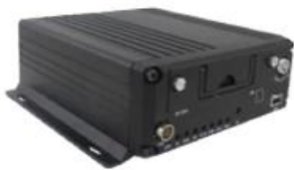
8114 Series- AHD 4CH