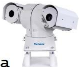
PTZ HD Camera Series