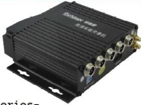
210 Series- AHD 4CH (Top Sale)