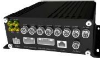
9108 Series- 8ch NVR /9204 Series- 4ch NVR