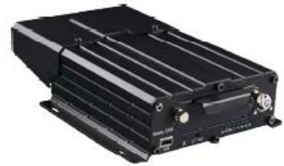
7008 Series- D1/720P 8CH