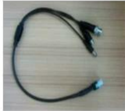
AV Input & Output Cables