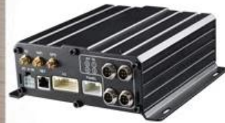
7000 HDD Mobile DVR