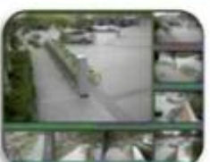
Fixed place monitor