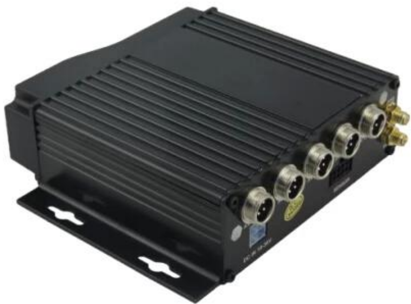
Device back view