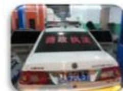
Road Police Car