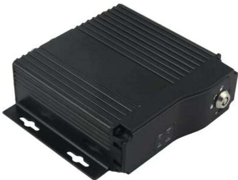
Device front view