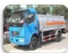
Dangerous chemical car