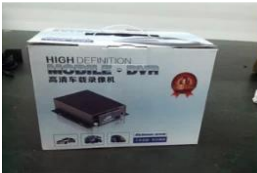
Richmor Brand Package

Neutral paper box or Color paper box with Logo Richmor printed,also welcome customized package.