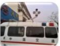
Traffic Inspection Car