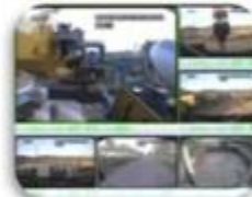
Civil Work Vehicle