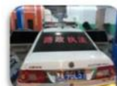
Road Police Car