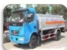
Dangerous chemical car