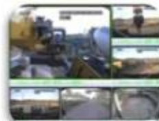
Civil Work Vehicle