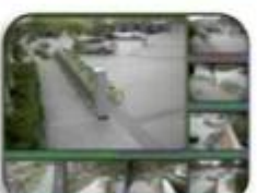
Fixed place monitor