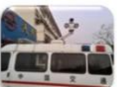
Traffic Inspection Car