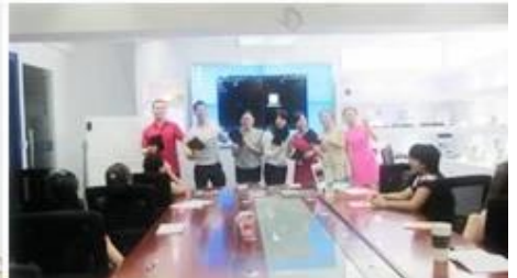
Inner Training after study from Alibaba in July