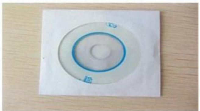
CD ( Manual & Software Inside )