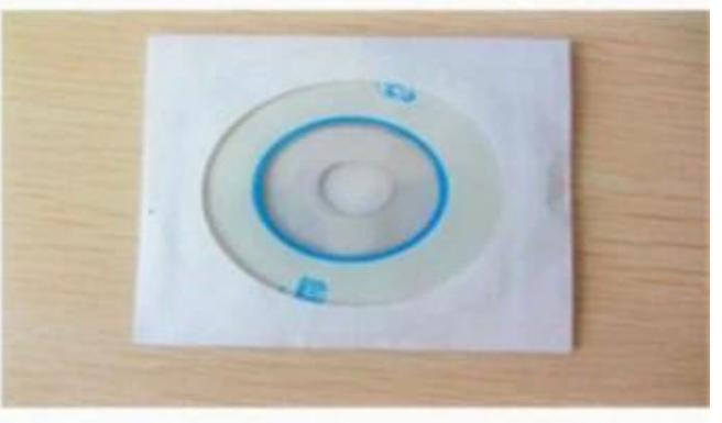
CD (Manual & Software inside )