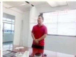
lecturer for Execution