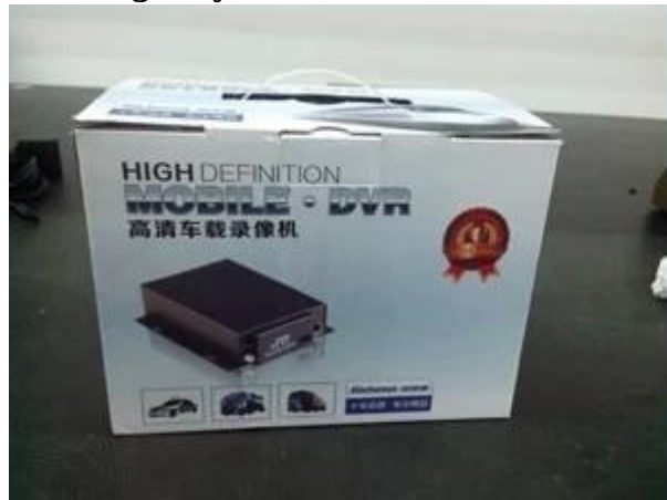
Richmor Brand Package