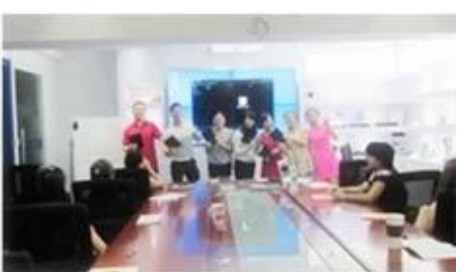
limer Transing after study from Alibaba in July