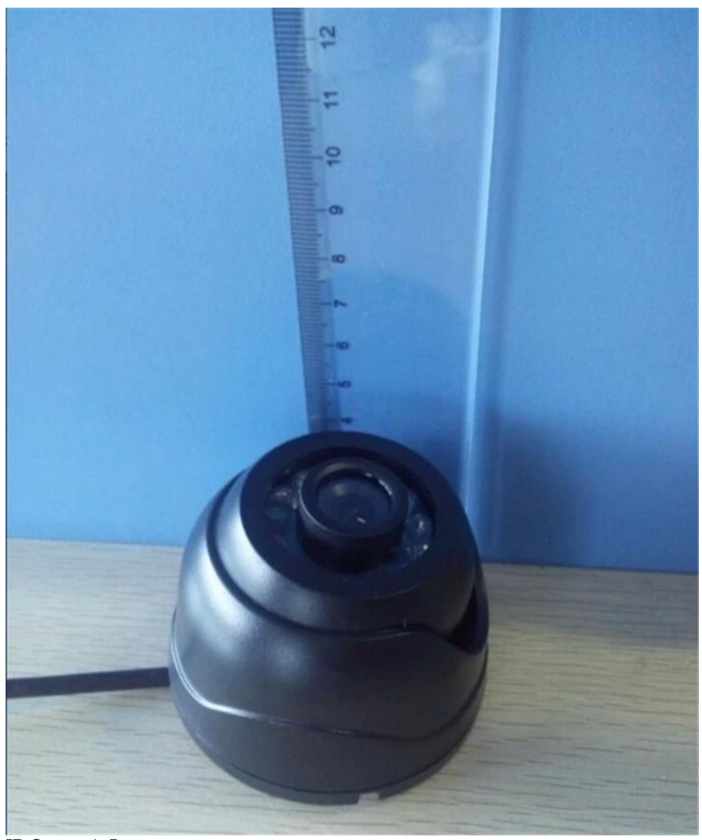
IR Camera's Parameter: