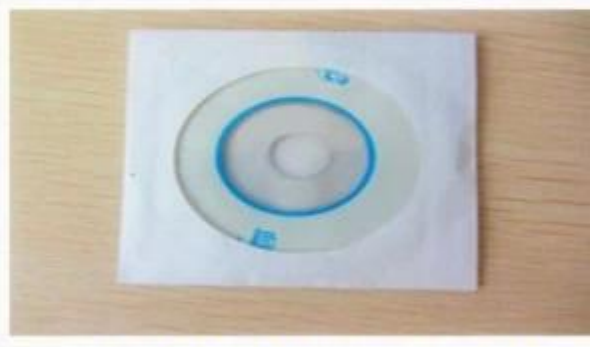
CD (Manual & Software inside)