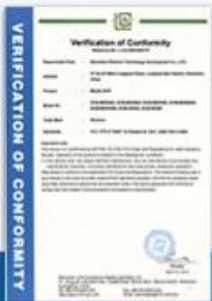
VERIFICATION OF CONFORMITY