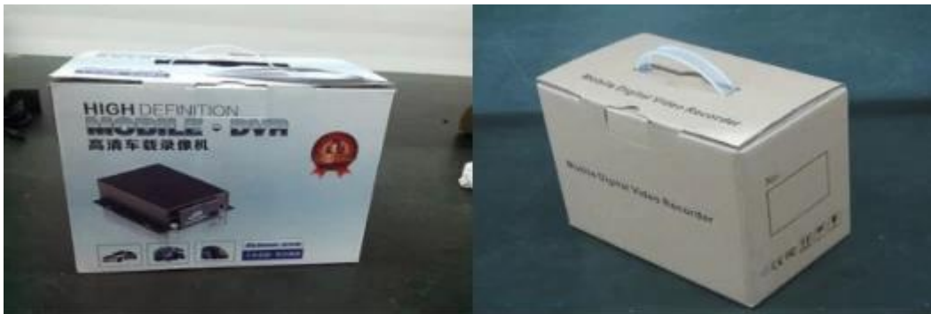
Richmor Brand Package

Neutral paper box or Color paper box with Logo Richmor printed,also welcome customized package.