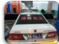
Road Police Car