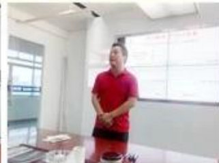
lecturer for Execution