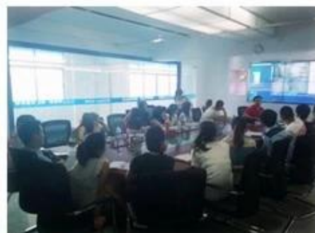
Technical Training For Fast Response to Customer Richmor 锐驰曼