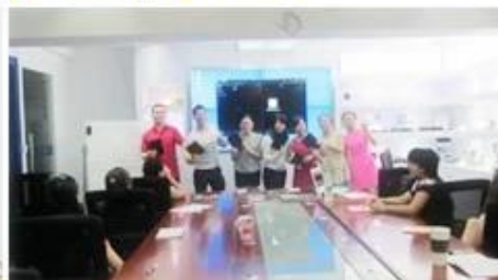
Inner Training after study from Alibaba in July